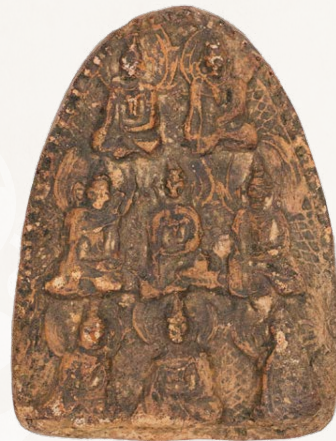
Buddhist Votive Plaque

Indian origin 1 st century BCE-1 st century CE Terracotta 4.7 x 5.8 Fragment and cracked