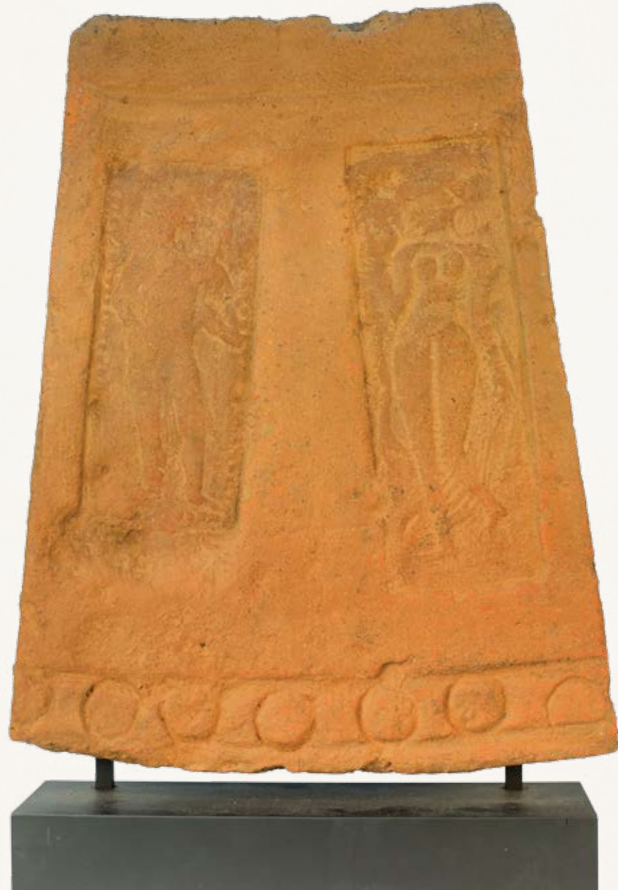
Plaque showing a male and a female figure in two frames.