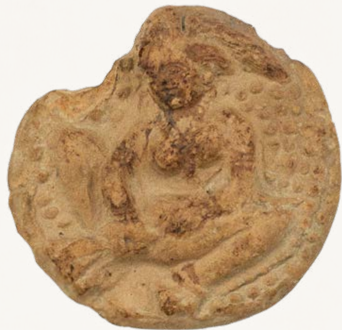
Fertility Goddess figure

Indian Origin 1 st century BCE-1 st century CE Terracotta 5 x 4.5 Broken at a place