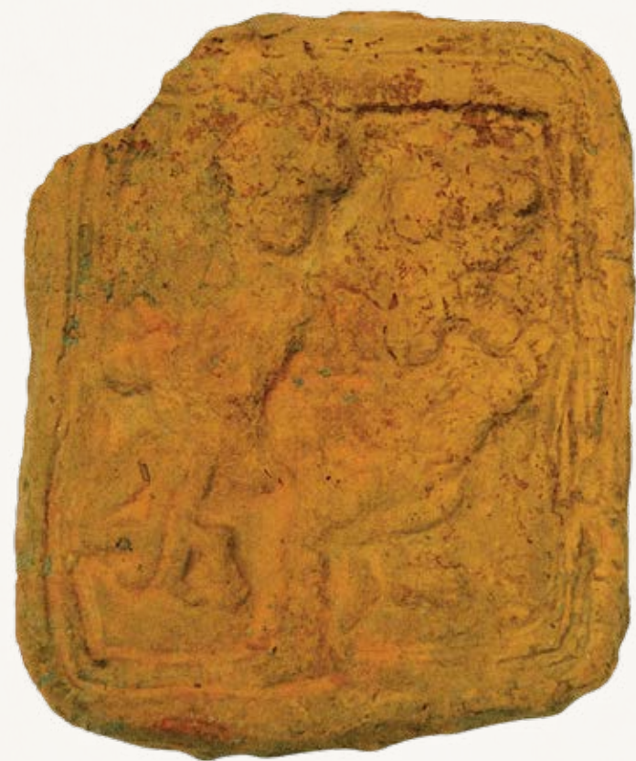
Plaque with two figures (Mithuna)