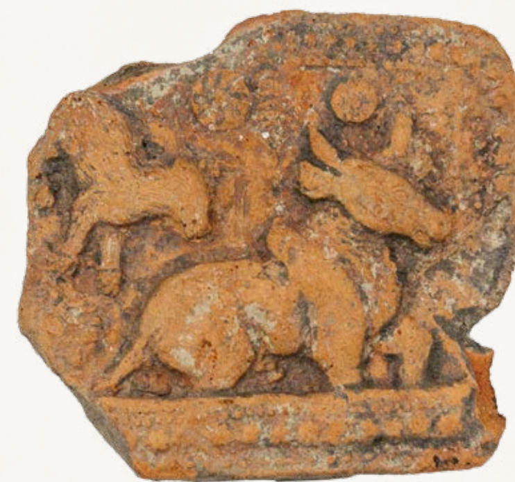
Plaque of Buffalo in water and Tiger