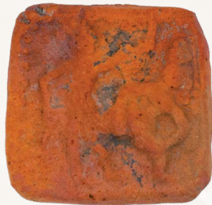
Plaque of Erotic couple