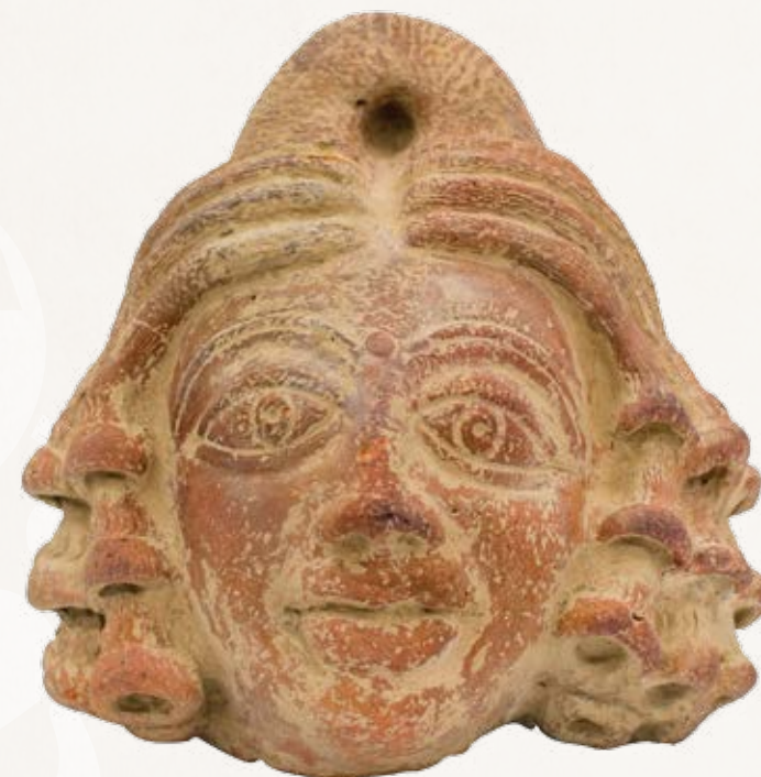
Female Head Indian Origin Gupta period 5 th century Terracotta 519.1 x 7.8