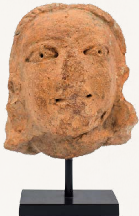
Head Indian origin Gupta period 5 th century Terracotta 10.5 x 7