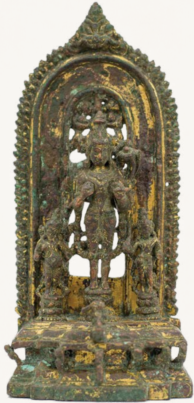
Surya on chariot drawn by 7 horses