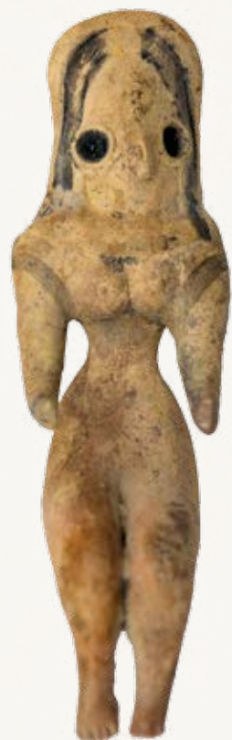
Female figurine Indian origin 5 th – 3 rd Century BCE Terracotta