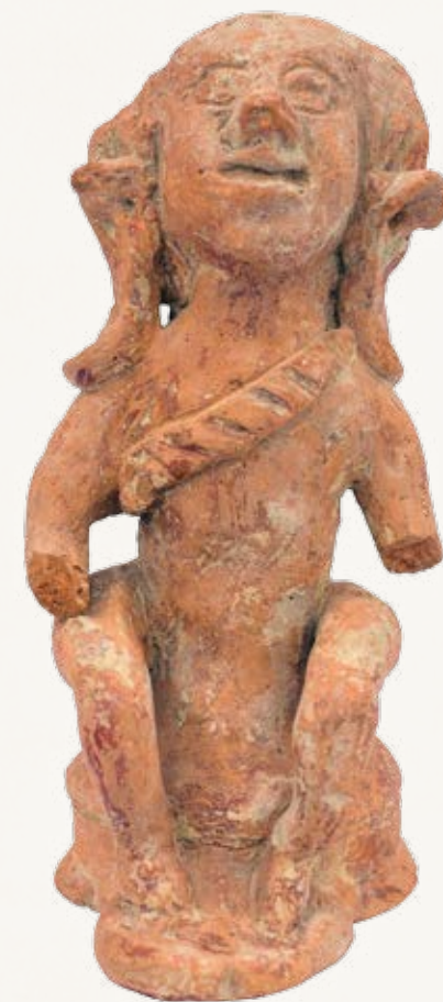
Seated mother Goddess Indian Origin Gupta period 5 th century Terracotta 19.1 x 10.8 x 8.5